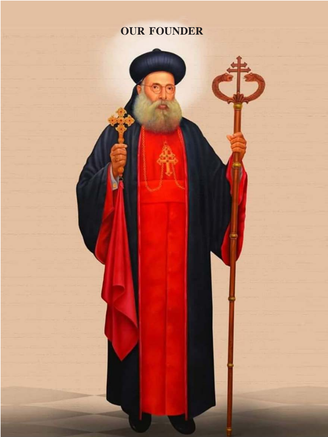
SERVANT OF GOD ARCHBISHOP GEEVARGHESE MAR IVANIOS (1882-1953)